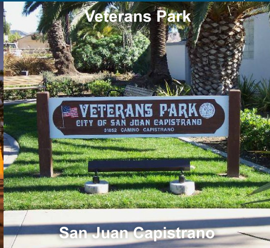
San Juan Capistrano